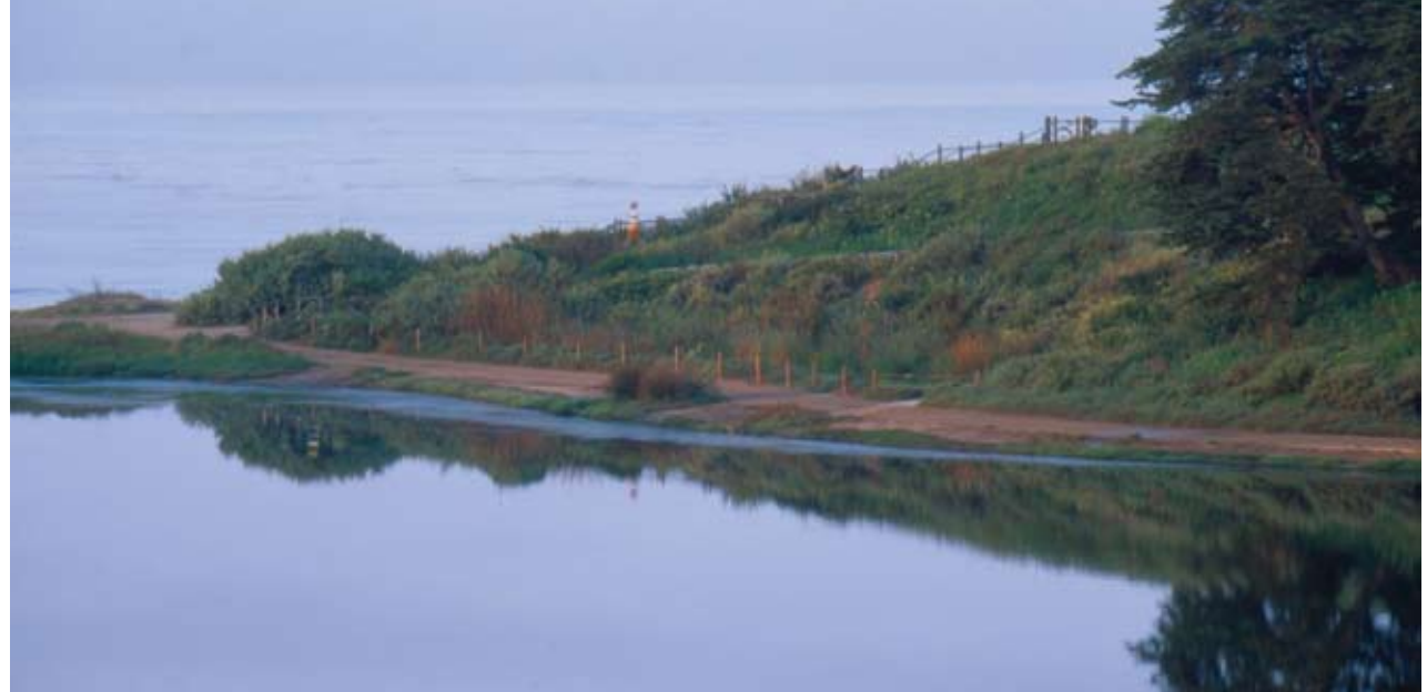
A boardwalk of recycled composite lumber brings visitors to the largest vernal pool and cuts a direct path from the residence halls to the ocean bluffs.