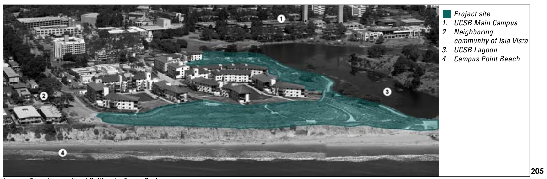
Lagoon Park, University of California, Santa Barbara