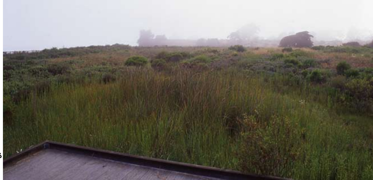
View into the vernal pool from the central observation platform on a foggy day.